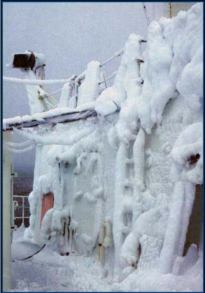
R/V Knorr, Labrador Sea, 1997